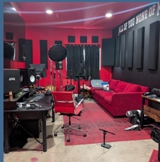
Sacramento Youth Center Music Room