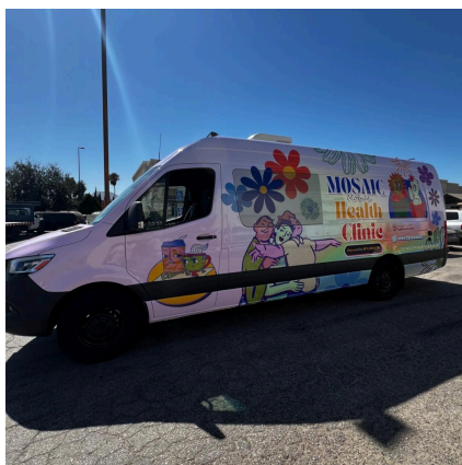
RPYA Mosaic Mobile Health Clinic

RPYA is partnering with the University of California, Riverside School of Medicine to make the van fully compliant for street medicine, which will expand RPYA's capacity to deliver on-site MOUD treatment, psychiatric, and medical care. This will help to overcome barriers that disproportionately impact the most vulnerable young people - access and transportation.