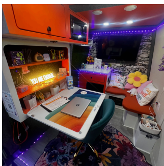
Inside the MOSAIC Mobile Health Clinic van.

RPYA shared that the mobile van reflects a commitment to fostering community trust, bridging critical gaps in services, and ensuring that every young person knows they have a safe place to turn for support and healing.