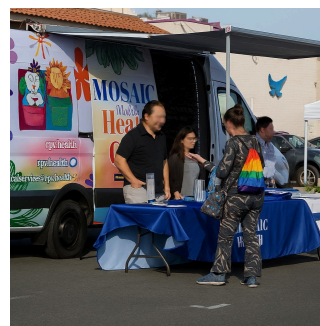
RPYA mobile clinic members engaging in community outreach.